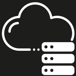
Memory and Data Storage

Our resistor networks offer absolute and tracking ratios, custom resistive value pairing, and tailored circuit patterns.