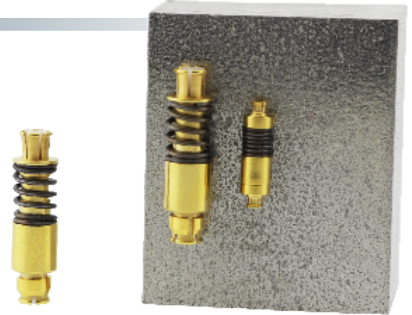
Figure 1: Comparison of non-magnetic to standard bullets in the presence of a magnet.